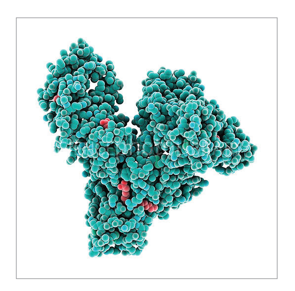
Figure 1. Human serum albumin structure (HSA).

LC-MS/MS quantification of albumin signature peptides was performed using a Xevo TQ-XS Triple Quadrupole MS. The full amino acid sequence<sup>11</sup> and structure of HSA<sup>12</sup> are shown in Figures 1 and 2, respectively. A total of 11 HSA tryptic peptides (highlighted in blue, Figure 2), and 2 MRM transitions per peptide, were monitored for quantification. These peptides were chosen based on literature<sup>3</sup> and were optimized for their signal intensity and selectivity. MS conditions for the HSA tryptic peptides are listed in Table 1. Of the 11 peptides, 4 were used for primary quantification: YLYEIAR, FQNALLVR, LVNEVTEFAK, and VFDEFKPLVEEPQNLIK (highlighted and bolded in blue, Table 1 and Figure 2).