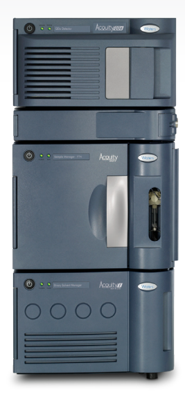
The ACQUITY UPLC® I-Class System and ACQUITY QDa Mass Detector.

Application of an existing toxicology library to the qualitative screening of medicines using the ACQUITY QDa — a promising tool for drug control.