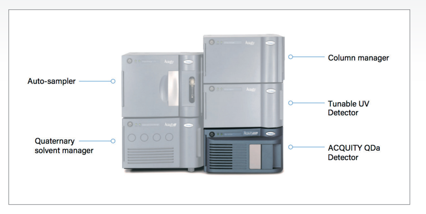
Figure 1. The ACQUITY QDa Detector. The compact footprint of the ACQUITY QDa Detector allows for easy integration into existing instrument stacks. Its plug-and-play design allows for the implementation of complementary orthogonal detection techniques with minimal effort into a single integrated system and workflow.

The ACQUITY QDa Detector enables the acquisition of orthogonal mass data across a wide range of small biotherapeutics as an in-line mass detector.