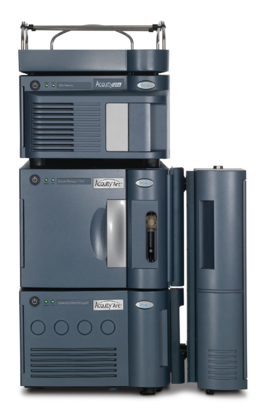
Figure 1. The ACQUITY Arc System. Seamless and efficient transfer of methods is enabled by Multi-flow path technology,<sup>™</sup> which allows HPLC and UHPLC separations to be run on a single platform.

Biopharmaceutical companies often transfer analytical methods within their own organization as well as to external contract organizations that may or may not use the same instrumentation for analysis. It is important that method equivalency is demonstrated across laboratories, regardless of the analyst or instrument used, in order to minimize lost productivity on method revalidation. The ACQUITY Arc System (Figure 1) allows scientists to switch seamlessly between two flow paths in order to emulate LC systems with different dwell volumes using a single platform. The purpose of this application note is to demonstrate method equivalency between an Agilent 1260 Infinity Quaternary LC System and an ACQUITY Arc System for transfer of isocratic and gradient methods for monoclonal antibody analysis.