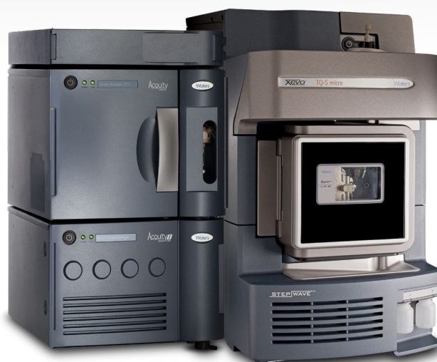
Figure 1. ACQUITY UPLC I-Class System and Xevo TQ-S micro.

A simple, sensitive UPLC-MS method for forensic toxicology screening of compounds in various biological matrices.