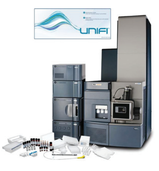
Figure 1. Biopharmaceutical System Solution with UNIFI for glycan analysis.

In addition to human IgG, we also tested the Rapi Fluor-MS labeled glycans released from a mouse IgG1 sample. It is well known that N-glycolyneuraminic acid and alpha (1-3) galactose containing N-glycans on mAbs generated from murine cell lines are glycans with immunogenic epitopes. These glycans present analytical challenges, due to 1) their low abundance in the glycan mixture, and 2) difficulty to characterize them structurally due to poor MS and MS/MS signals from using the conventional labels.