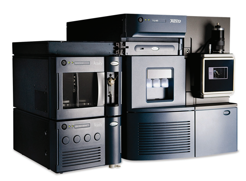
Figure 1. ACQUITY UPLC with Xevo TQ MS.

Measurement of 17-hydroxyprogesterone (17-OHP) by immunoassay is prone to analytical interference arising from cross-reactivity of reagent antibodies with structurally-related steroid metabolites. A method for the extraction and UPLC®-MS/MS analysis of serum 17-OHP and two additional adrenal steroids, androstenedione (A4) and cortisol, using the ACQUITY UPLC System with the Xevo TQ MS (Figure 1) is described.