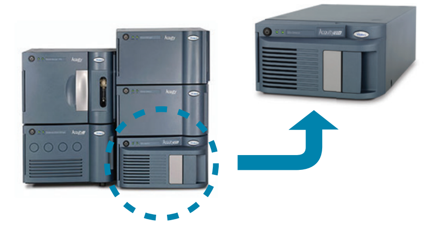
Figure 1. The ACQUITY QDa Detector. The compact footprint of the ACQUITY QDa allows for easy integration into existing instrument stacks. Its plug-and-play design allows for the implementation of complementary orthogonal detection techniques with minimal effort into a single integrated system and workflow.

The ACQUITY<sup>®</sup> QDa Detector is Waters' solution to meet the demands of today's fast-paced pharmaceutical work environment by enabling complementary optical and mass spec analysis techniques to be run on-line in a single screening workflow for improved productivity in data analysis.