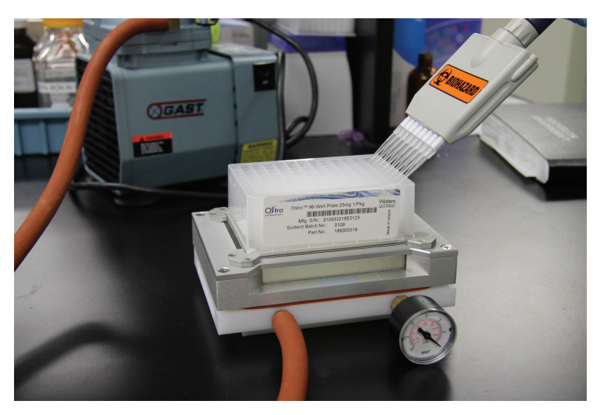
Figure 1. Typical setup for Ostro Pass-through Plate for analysis of milk.

Transfer 125 \mu L milk to a sample well (do not use a sample volume greater than 125 \mu L). Add 375 \mu L 0.2% formic acid in acetonitrile (ACN). Mix well with aspiration. Elute into collection plate well. Add 100 \mu L 200 mM ammonium formate in 50:50 methanol/ACN and mix well. Evaporate and reconstitute in 100 \mu L 25:75 ACN/25 mM aqueous ammonium formate. Figure 1 shows a typical setup for SPE using the Ostro Plate.