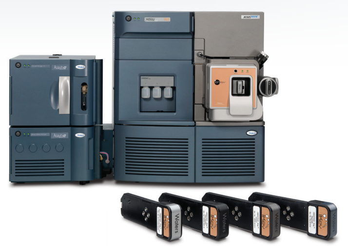
Figure 1. ionKey/MS System: comprised of the Xevo TQ-S, the ACQUITY UPLC M-Class, the ionKey source and the iKey separation device.

ionKey/MS: Enhanced MS with the turn of a Key. More sensitivity, more information from the same sample, more robust analysis. All with less solvent usage and less complexity to the user.