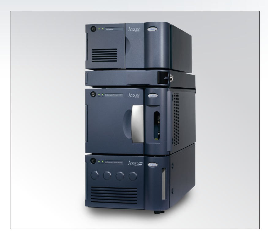
Figure 1. ACQUITY UPLC® H-Class System with PDA Detector.

The separation of all 13 dyes was achieved in less than eight minutes.