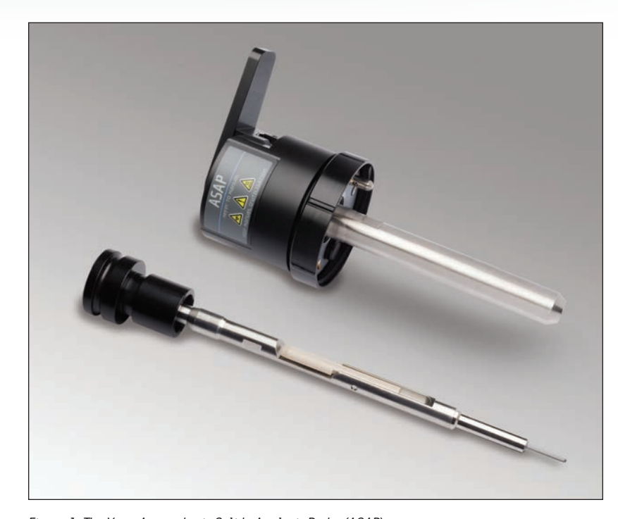
Figure 1. The Xevo Atmospheric Solids Analysis Probe (ASAP).

Xevo® TQD with ASAP provides a rapid and easy screening method for disperse dyes.