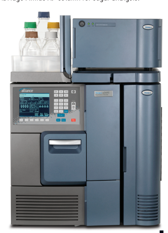
Figure 1. Alliance HPLC System with 2414 Refractive Index Detector.

Using Waters® proprietary amide column chemistry, Schiff bases are avoided, thereby eliminating the aforementioned problems. In this study, we show the versatility of the Waters XBridge Amide XP column for sugar analysis.