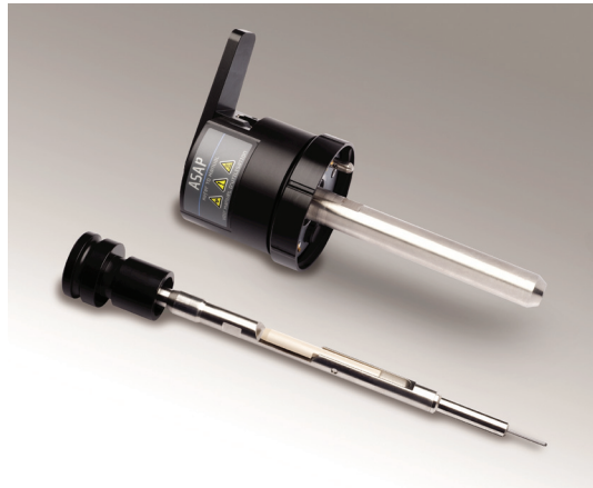
The Atmospheric Solids Analysis Probe (ASAP).

Food safety regulators require that all products found to be contaminated with DEHP be recalled and removed from the shelves immediately. Rigorous tests must be carried out on six categories of food and beverages including sports drinks, fruit juices, tea drinks, fruit jam and jellies, food powders, and health supplement tablets. This poses a major analytical challenge, as the complexity of food matrices requires the use of different extraction techniques. Thus the ability to rapidly screen for the presence of DEHP using a simple technique with minimal sample preparation and no chromatographic separation would be advantageous.