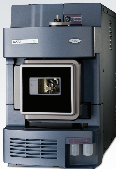
Xevo TQD System with RADAR functionality.

Oasis HLB is a unique sorbent that enables simpler methods for SPE with proven results.