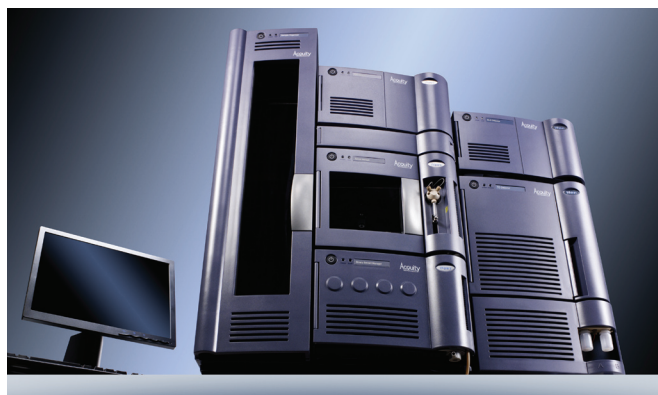
Figure 1. ACQUITY TQD System.

Given the selectivity and sensitivity of MS/MS detection, UPLC/MS/MS analysis with the Waters® ACQUITY® TQD System (Figure 1) in combination with specialized software, ProfileLynx™ and QuanOptimize™ Application Managers, is the ideal choice for quantitation of a solubility screen.