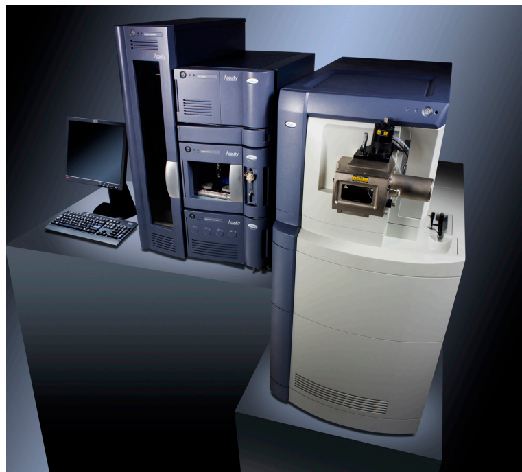
Figure 1. The ACQUITY UPLC system with the Q-ToF Premier for metabolite ID.

This application note shows the consistent high spectral resolution obtained from the Q-ToF Premier with increasing data acquisition speeds. This is demonstrated using in vitro microsomal incubations of buspirone. All analyses were performed with the ACQUITY UPLC and Q-ToF Premier.