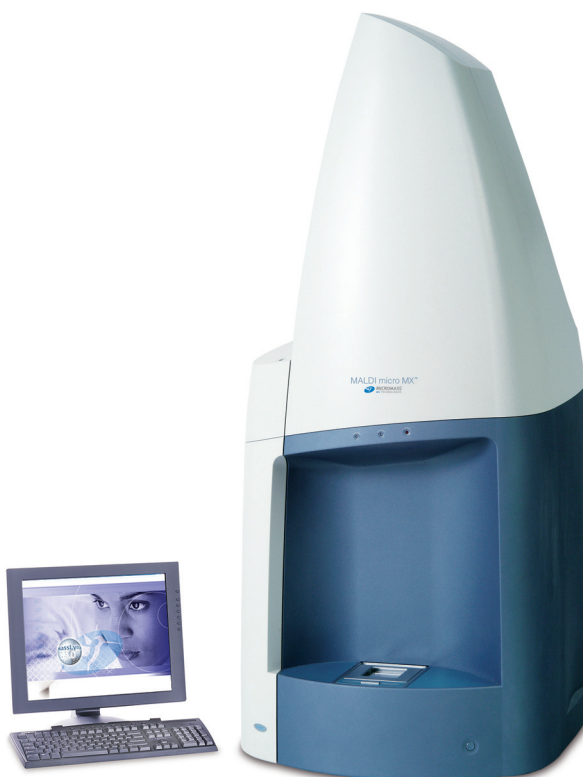
The Waters® MALDI micro MX™ Mass Spectrometer with PSD MX™ technology.

The benefits of PSD MX are a significant reduction in both analysis time and sample consumption in comparison with conventional PSD. Additionally, with PSD MX there are no typical side effects from using an ion gate, such as loss of transmission (and hence sensitivity) and resolution.